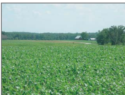
Rural Ackerman Creek Watershed