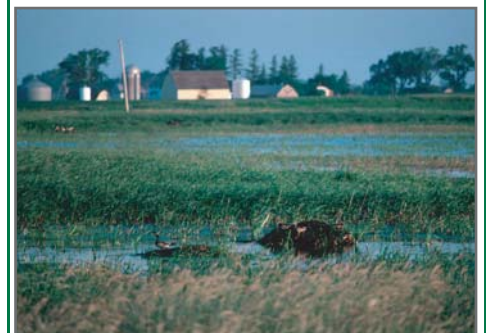
Wetlands can be seasonally or permanently saturated. Wetlands absorb floodwaters and are the "kidneys" of the watershed by acting as a filter for pollutants.

Wetland banking is a system where landowners are paid by private developers to restore wetlands as a compensation for a loss of wetlands on a development site. For more information visit www.epa.gov/wetlandsmitigation