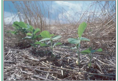
Young soybean plants thrive in the residue of a wheat crop. This form of no till farming provides good protection for the soil from erosion and helps retain moisture for the new crop.

Conservation Tillage is a system of crop production with little, if any, tillage. By leaving crop residue undisturbed for as long as possible, microbial and other biological activity in the soil feeds on the stalks, leaves and other crop residues. This increases organic matter, improves soil tilth and, ultimately increases soil productivity. Soil erosion can be reduced by 90% (compared to intensive tillage). While we have long thought of soil erosion as reducing top soil, we now know it's one of the top 'pollutants' in America's waters.