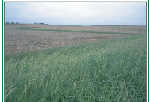
Buffer strips in the foreground and grassed waterway in the distance protect the natural resources on this farm northwest of Peoria, Illinois. The buffer strip reduces soil erosion and keeps the nearby Illinois River flowing with cleaner water.